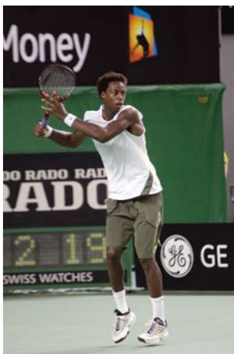
1 Monfils has a grip that is almost western. With the hands on top of the racquet handle, he has a simple relaxed takeback of his arms and shoulders.