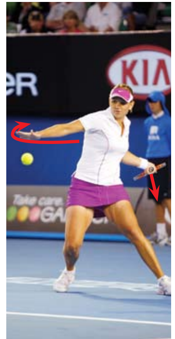
4 The right arm starts to pull the body open.