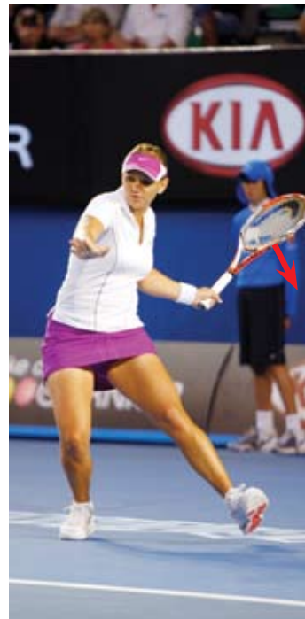
3 With this western grip, the racquet faces towards the ground.